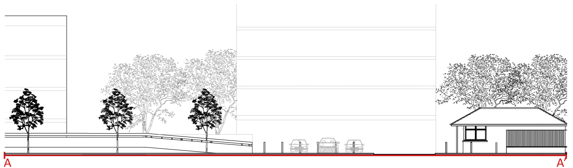
Existing Elevation - vehicle entrance from Gascoigne Place

Pergola extending over growing space and entrance to underground carpark