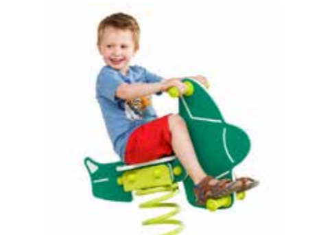
Upgrade existing springer.