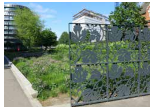
Decorative laser cut signage at entrances to estate (5).