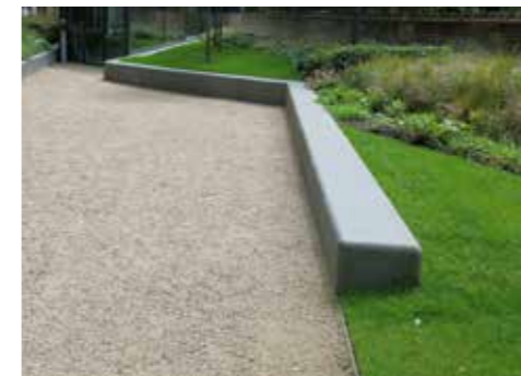
Linear seat/planter to act as boundary to car park (4).