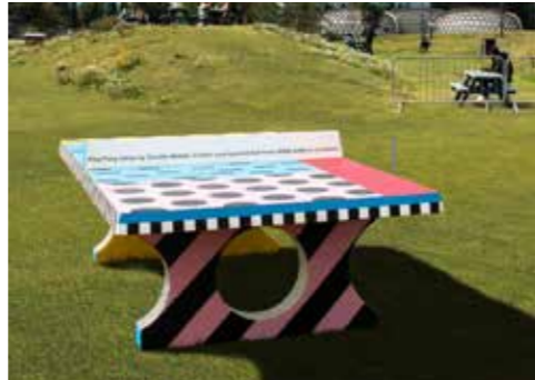
Concrete table tennis table (4).