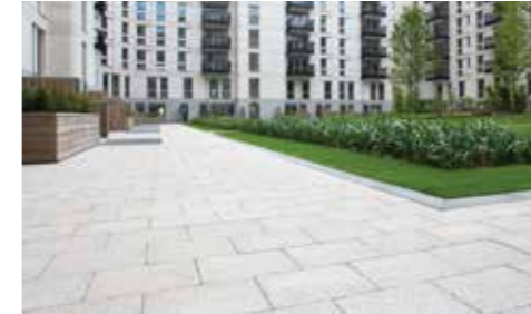
Small format paving slabs.