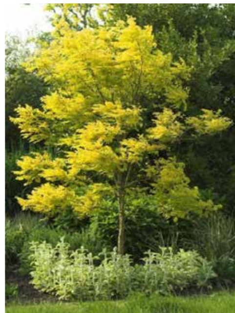
Tree options for entrance. Option one - Honey Locust Sunburst.