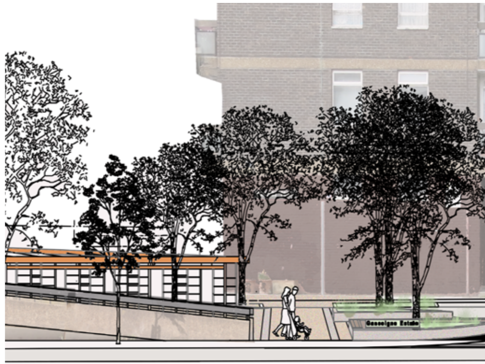
New entrance with planters, trees and pergola over growing space. New laser cut signage for entrance.