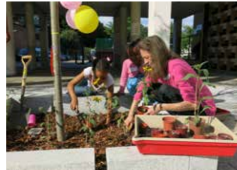
Encourage a gardening club (3).