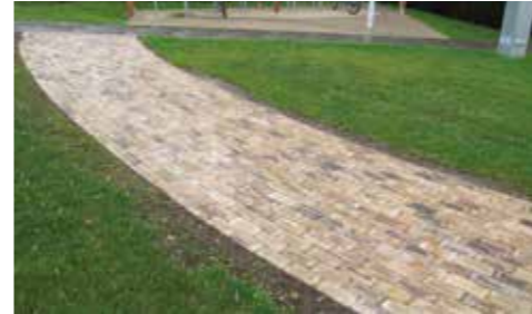
Buff brick pavers for detail and edges around paving.