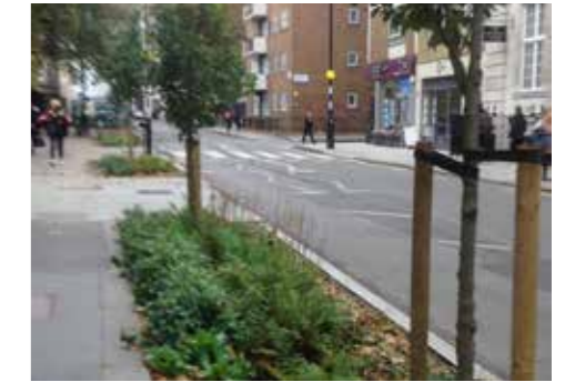
Rain gardens along edge of parking spaces.