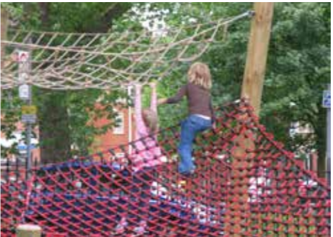
Scramble nets for all ages (1).