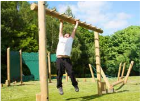
Different play options - monkey bars and fitness equipment (1).