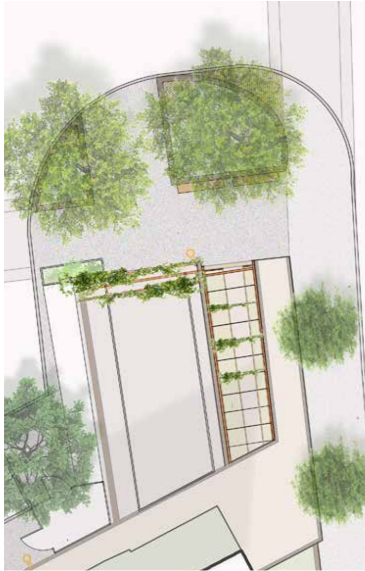
Pedestrian space increased with large planted area and seating at the entrance. Upgraded growing space with pergola which extends across entrance to underground carpark to create screening with climbing plants.