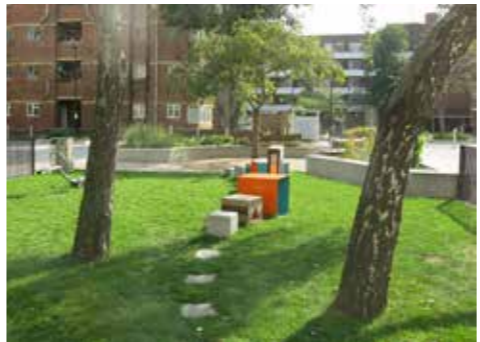
Playful stepping stone path (2).