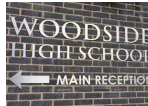
Laser cut signage examples