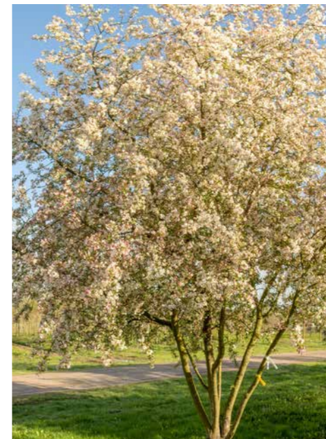
Crab apple grove opposite the Hut (2).