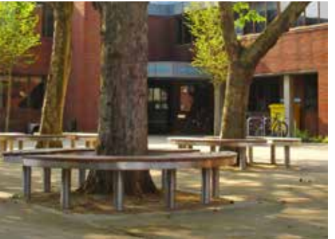
Tree seat (2).