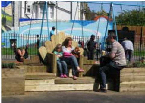
Playful seating and growing space (3).

Connect all the spaces around the Hut to create a sociable play, gardening and growing space.