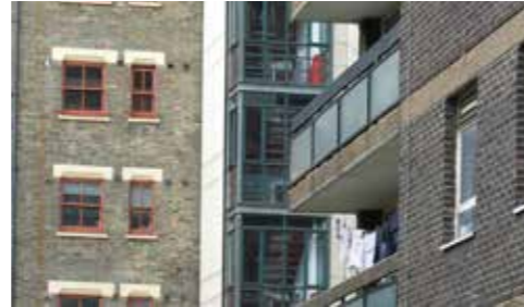
Materials palette based on brick colours in existing buildings.