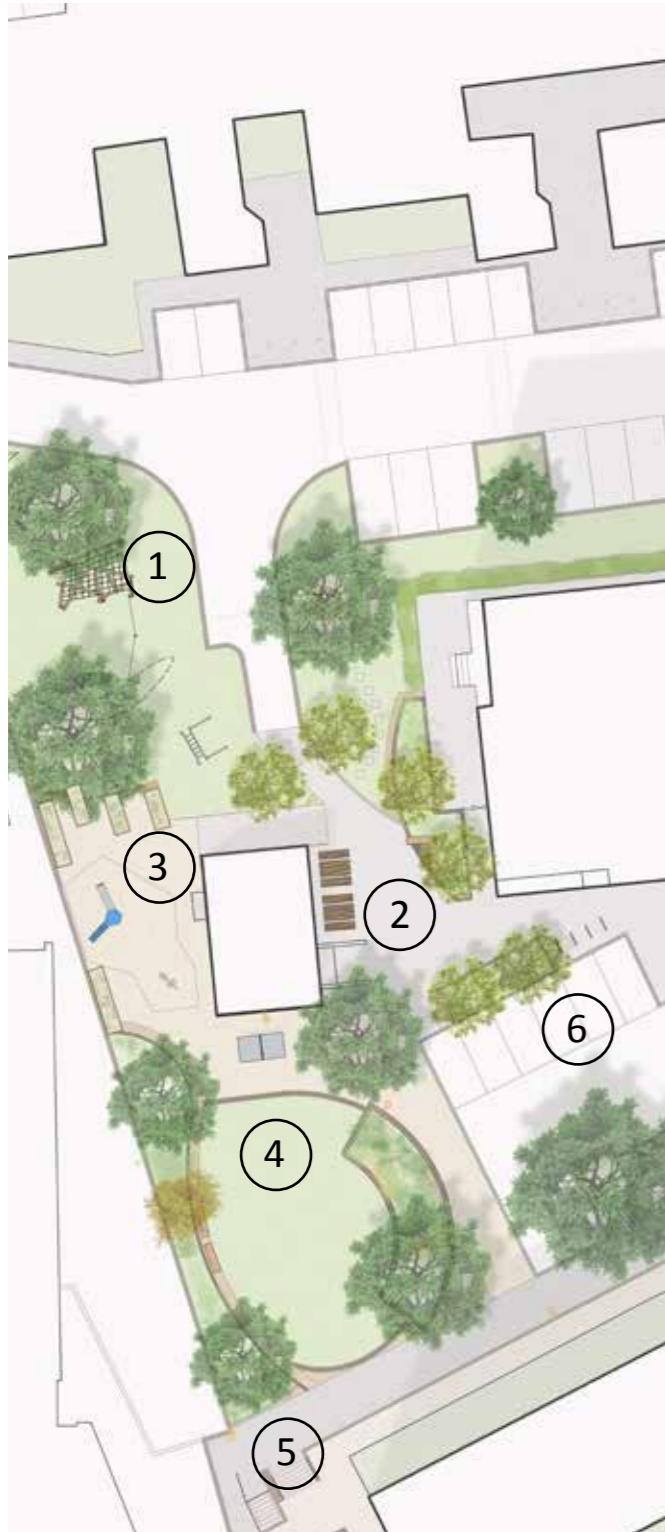
Opportunity to integrate the Hut into a new growing and social area.