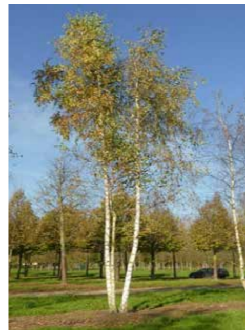
Tree options for entrance. Option two - Silver birch.