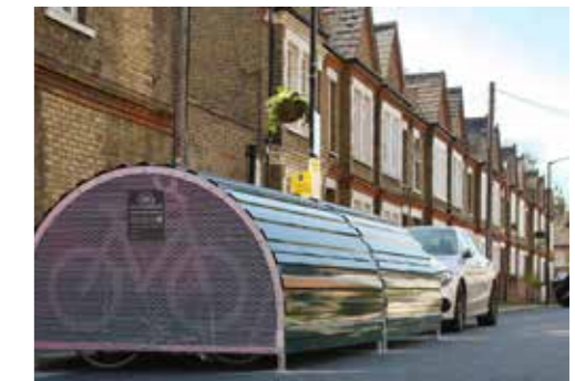
Shared lockable bike shelter.