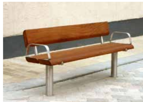
Sturdy seats with arm rests (4).