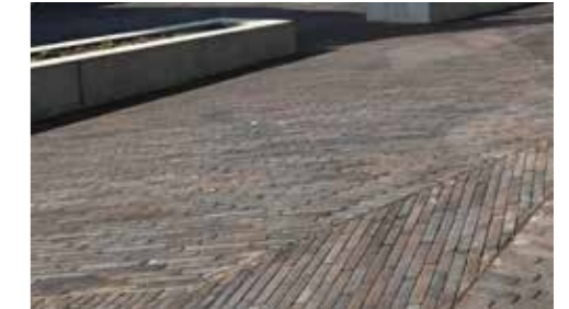
Darker brick paver for planter edges.