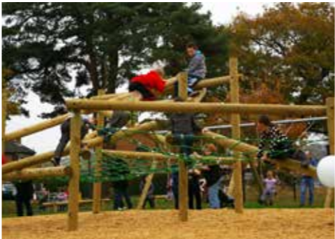
Add climbing play opportunities (1).