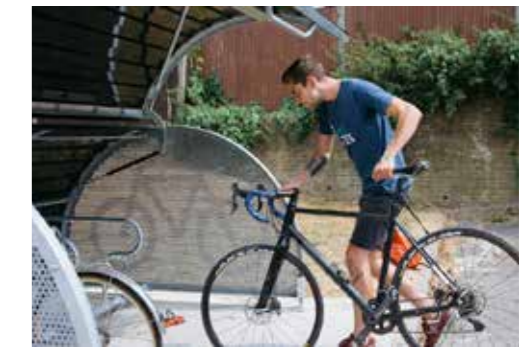
Individual bike lockers.