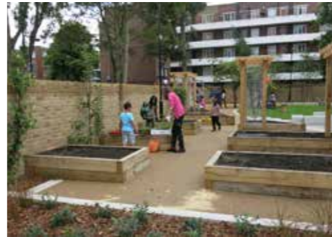
Growing space next to play area (3).