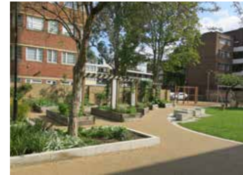
Growing space and garden space.