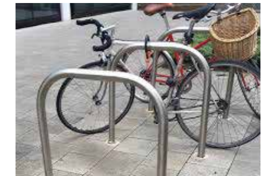
Visitor cycle racks outside Dunmore Point and Wingfield House.