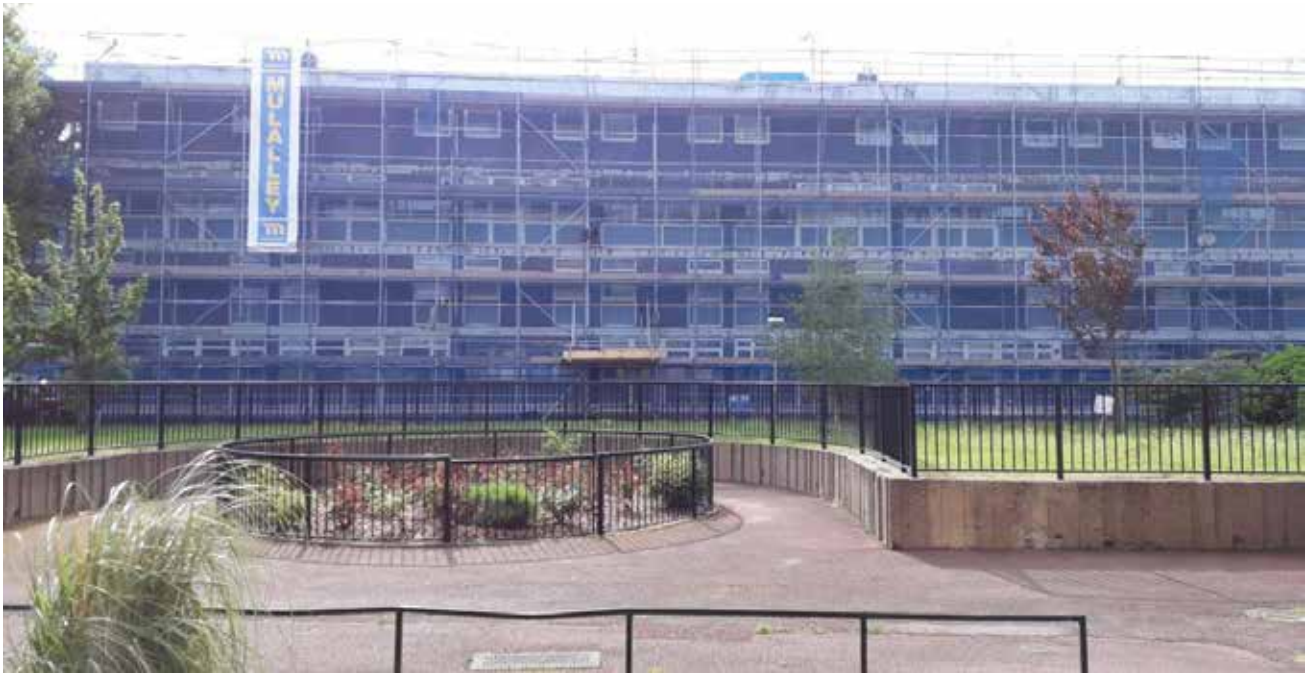
Old Market Square roof (before)