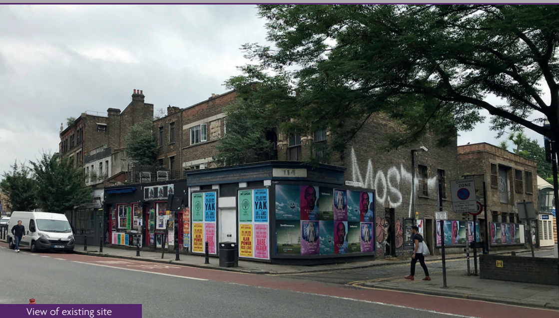
View of existing site